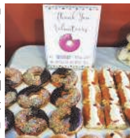
"We DONUT know what we would do without you"