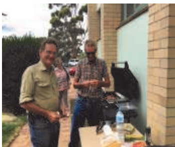
Ongerup locals enjoying the sausage sizzle at our Market Day

Seven teams participated in our annual Community Fox Shoot and breakfast. Participants braced the bad weather to cull a total of 114 foxes and the "Corackerup Killers" taking the winners trophy home for an impressive 30 foxes, 1 cat and 1 rabbit. We thank North Stirling Pallinup NR, South Coast NRM, Ray's Sports Power, the Ongerup Roadhouse and Hamersley Shearing from their support.